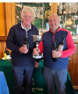
Saturday Boys' Winner