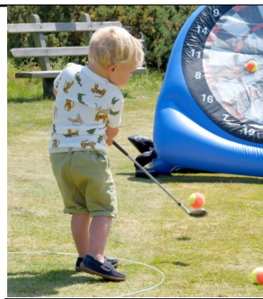
We start them young at Southwold!