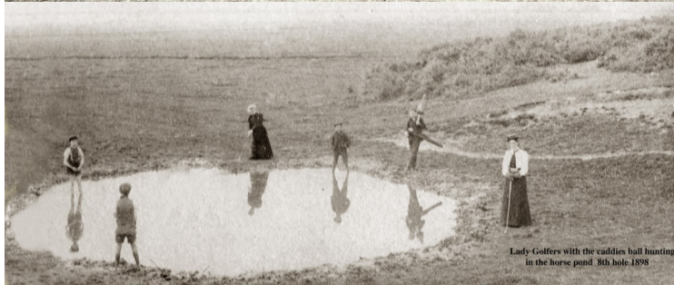
Lady Golfers with the caddies ball hunting in the horse pond 8th hole 1898