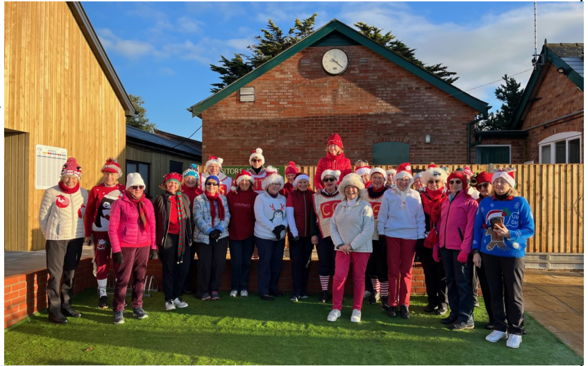
Ladies Christmas Party all Dressed Up for the Occasion

The Ladies organised a very successful Christmas Fayre which raised over £1,600 for charity, £1,000 being donated to the Irrigation project fund and £500 allocated to Dementia UK. Thank you all for your time and energy. The ladies Christmas golf competition was played on one of the kindest winter's days we could have hoped for, bright and sunny. The best dressed Red-and-White team and the best Jingle-bell hat competitions were well-contested and all the players looked so festive moving around the course in the sunshine.