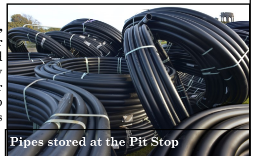
Pipes stored at the Pit Stop