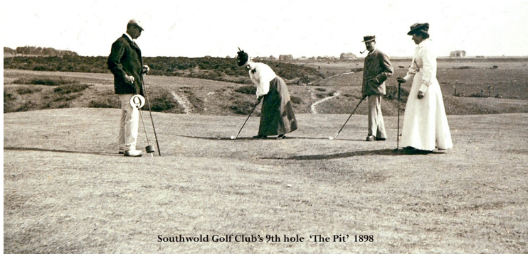
Southwold Golf Club's 9th hole 'The Pit' 1898

Permission was sought from The Southwold Corporation to play golf on the common. This was granted on 4 th February with the first game being played on 28 th August 1884. (The Quoit Club became a separate entity).