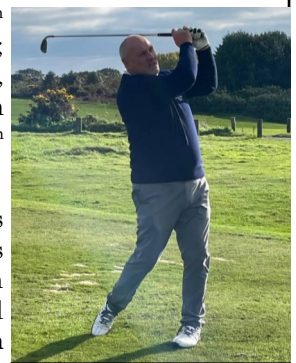
The Winning Drive