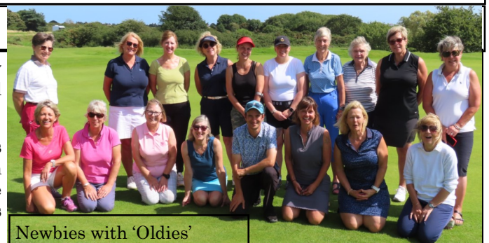
Newbies with 'Oldies'

Since then they've gathered weekly for hourly sessions with Tom and myself. The new swingroom has given an added dimension to learning as well as keeping everyone warm and you'll hear plenty of laughter when the ladies are gathered!